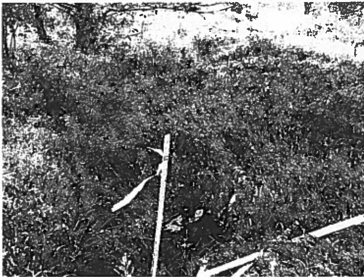
Area 4. Upland rill.